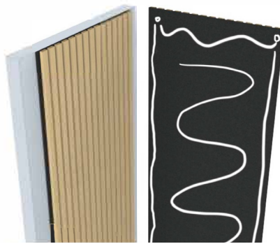
B. Attach acoustic panels to the wall with construction adhesive.

For more information from our expert team on our natural, unique and beautiful timber veneers of exceptional quality: